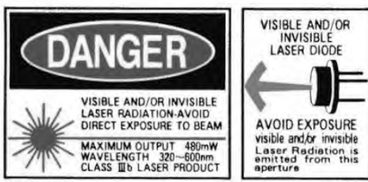
This product is comply with 21 CFR Part 1040.10

This laser diode emits highly concentrated red light which can be hazardous to the human eye and skin. This diode is classified as CLASS 3 laser product according to IEC 60825-1 and 21 CFR Part 1040.10 Safety Standards.